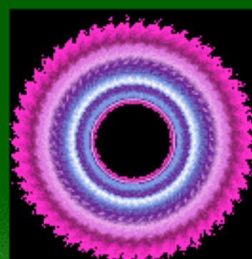
Symmetric fractals constructed using iterated function systems (IFS) where the functions in the IFS are obtained from a single generating function by rotation (M. Field & M. Golubitsky).